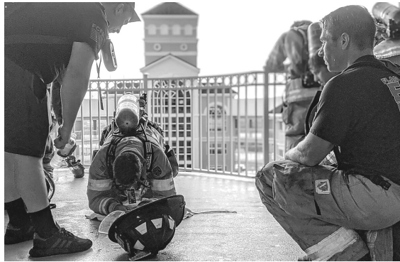
Firefighters shared some powerful moments during their 10 trips up 11 flights of stairs.

Justice Center; Clerk of the Circuit Court and Comptroller; County Jail; Tax Collector; Property Appraiser; Sheriff's Office; and Supervisor of Elections.