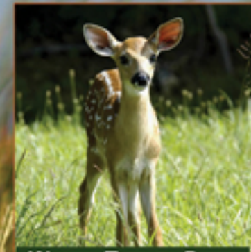
WHITE TAILED DEER

Green Trail: 1.1 mi. This walk takes you through a pristine hardwood swamp past an artesian spring fed pond, home to a bird rookery. Trailhead: N 29°39'25.47" W 081°14'03.75"