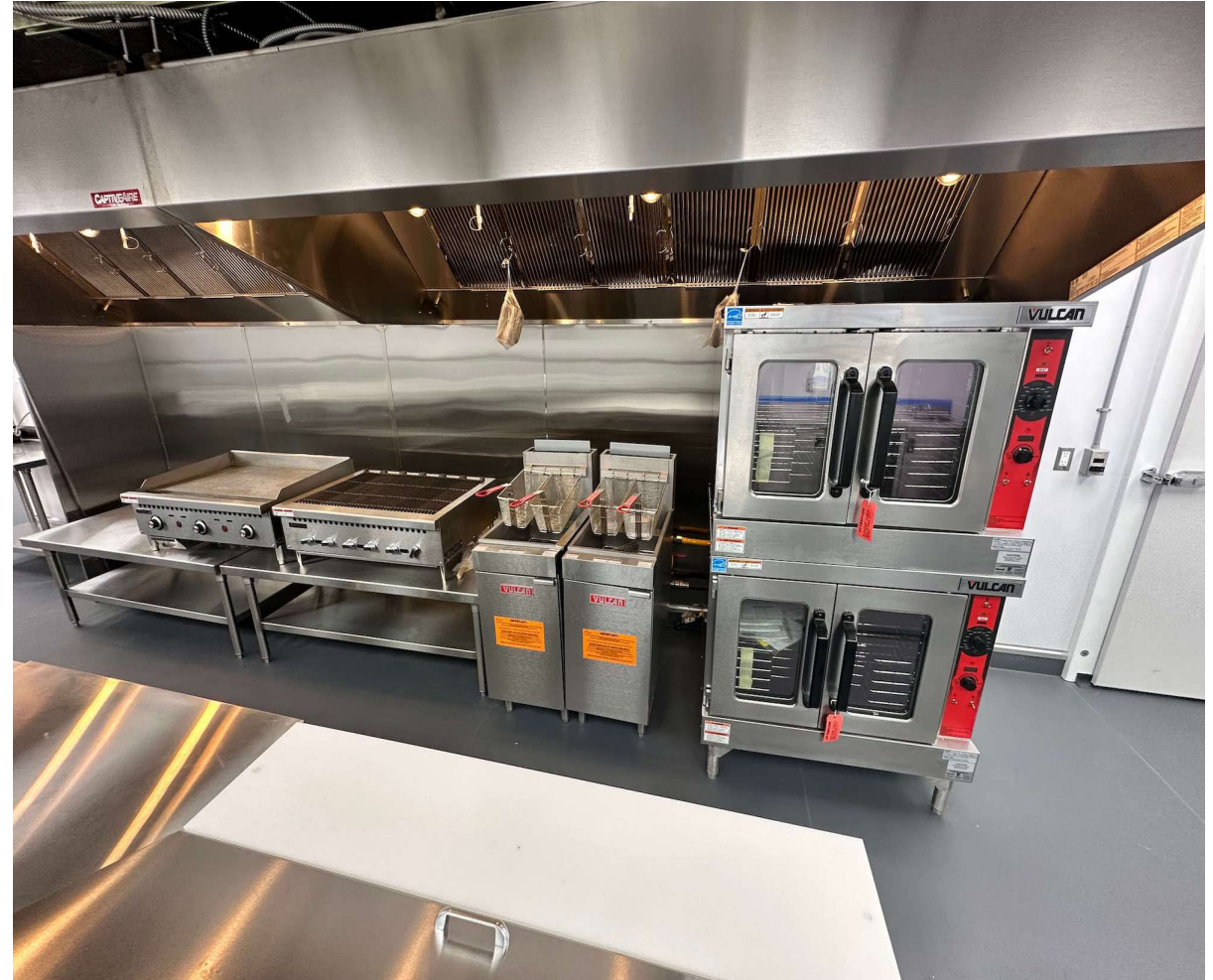
Fryers, Griddle, Grill and Ovens