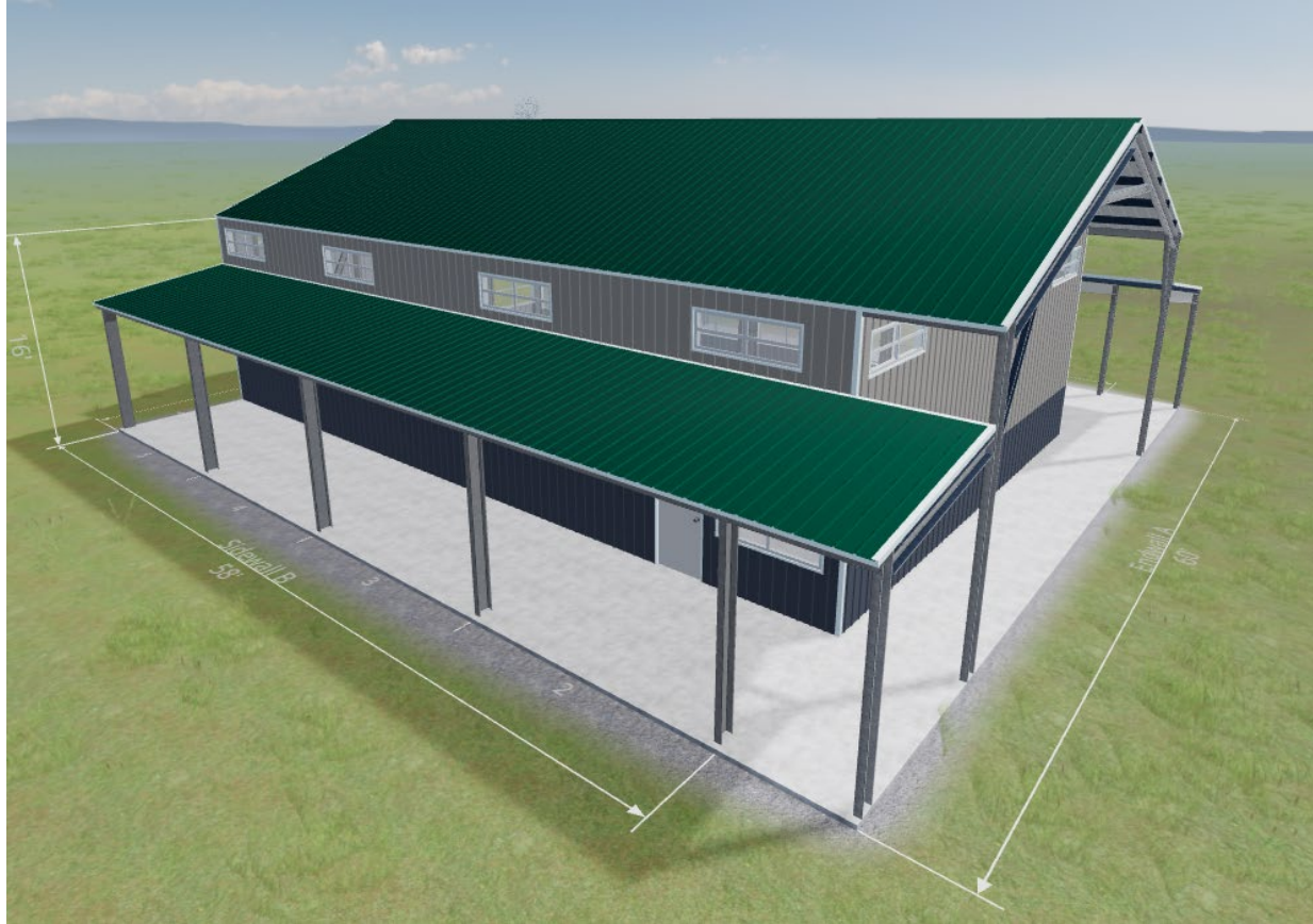
Front Elevation (East)