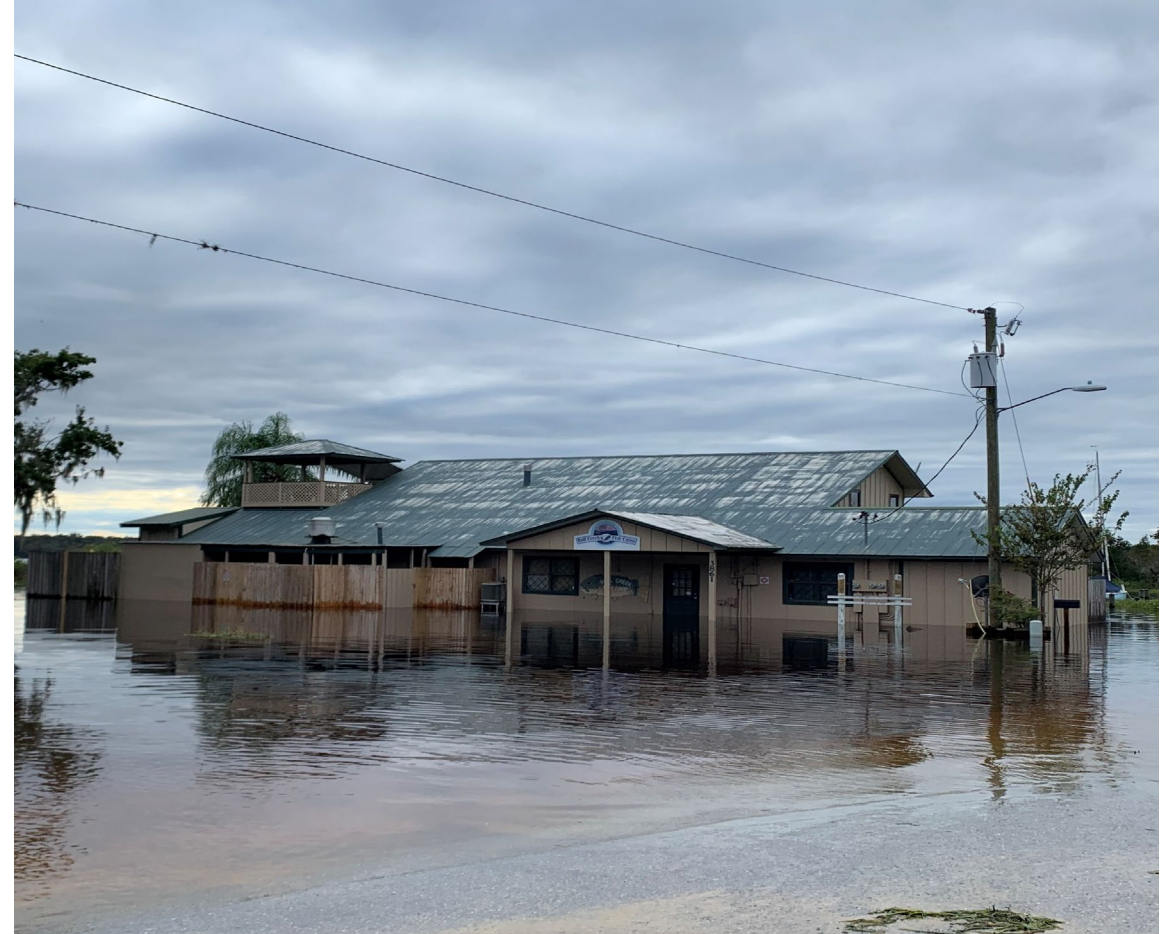
Bull Creek Campground