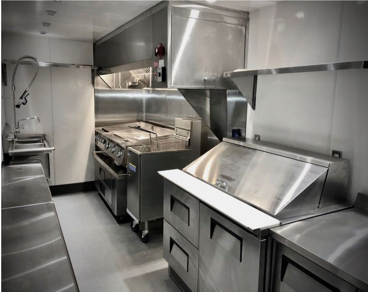
Sink and Prep Area