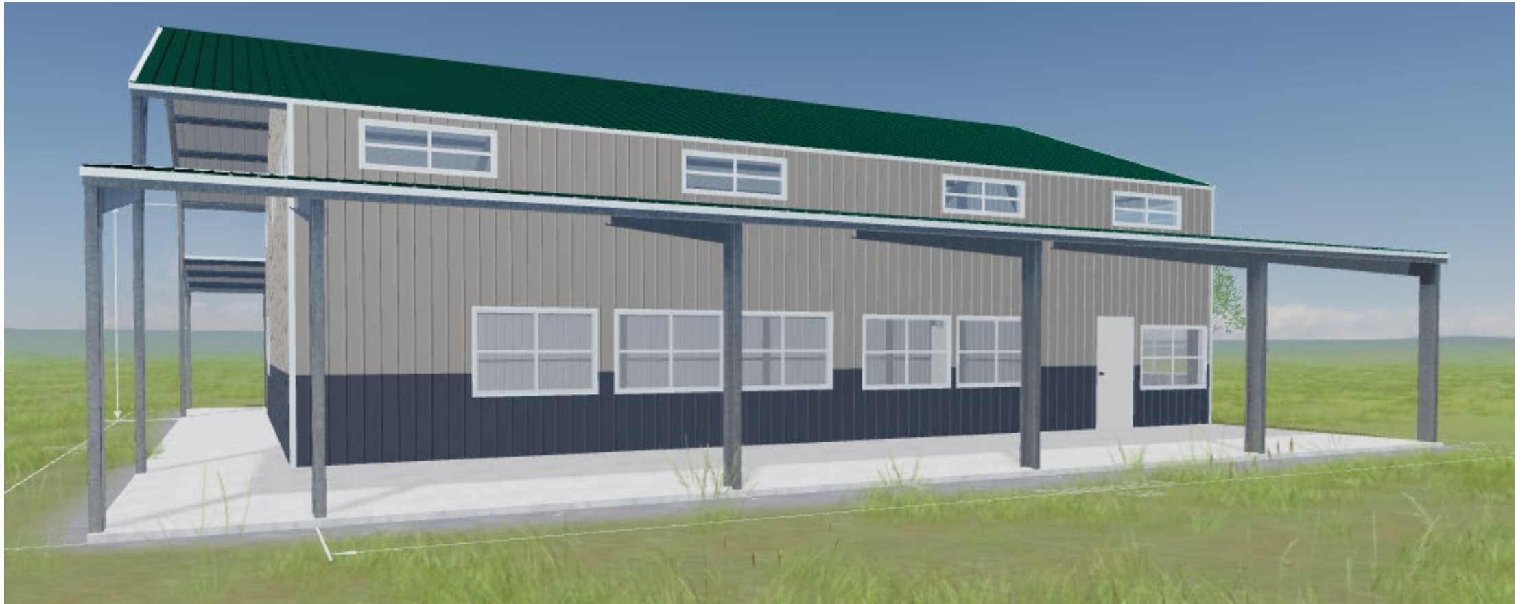
Elevation Facing Dead Lake (West)