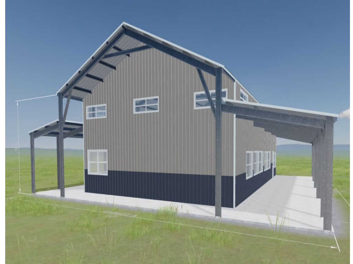
Side Elevation (North)